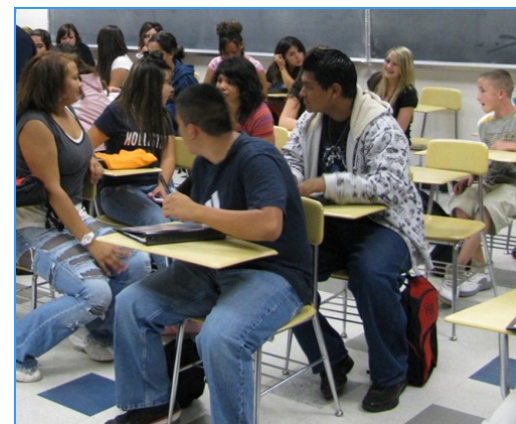
Summer Residential Class

The Summer Residential Program is a six week enrichment program for selected Upward Bound students. The program offers academic courses, social, and cultural activities.