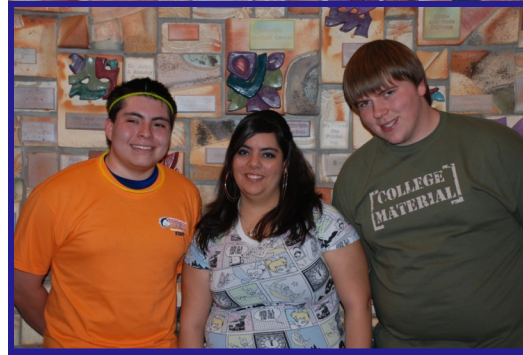
Tutors & Student

Upward Bound is funded through a TRiO Grant from the U.S. Department of Education, PR/Award Number P0A7A080944, For FY 2008-2011, $391,751.00 per year (100%) total funds.