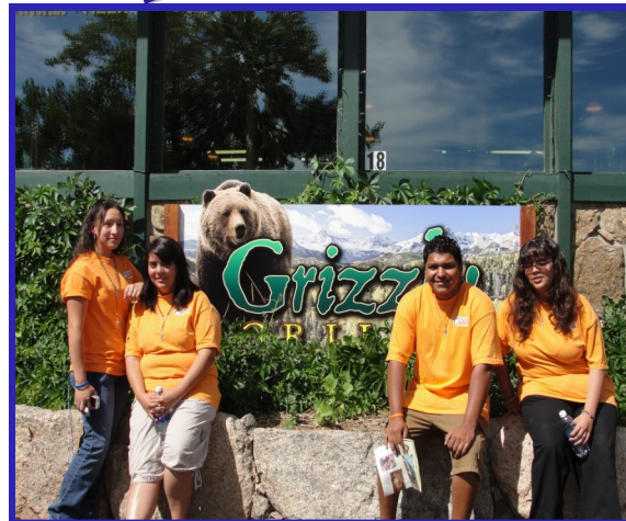
Day at the Zoo